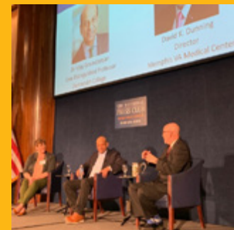
The Three Box Solution Keynote Address at the VHA Innovation Experience