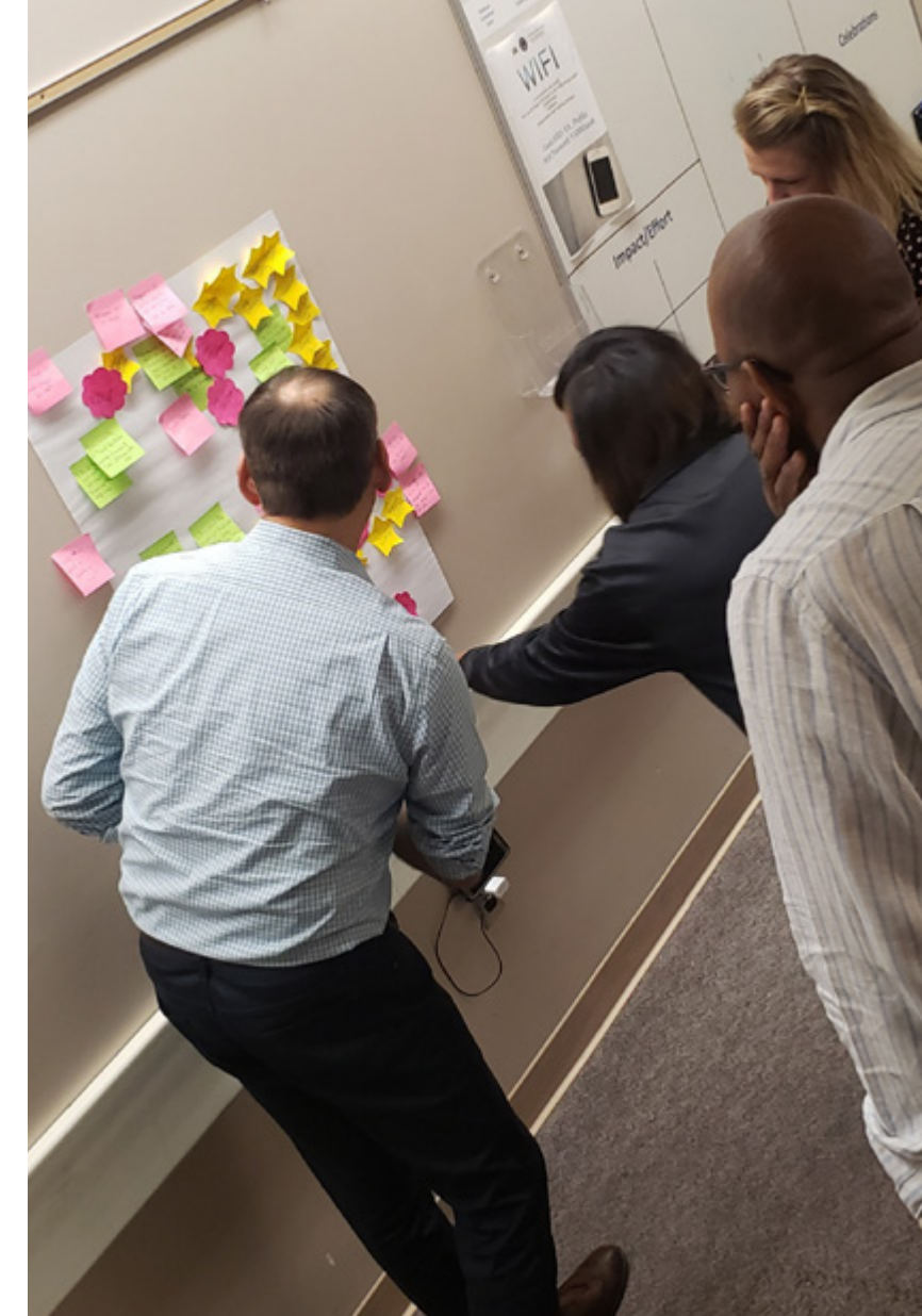
Participants at an HCD training

“Amanda and I were delighted to work with the more than 85 LVA 2019 program participants. We provided a two-day training, spread out over several sessions, to help the